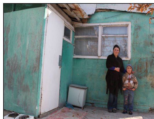
Mother and son in front of their home in Gyumri

"To live means to hope, i.e. to live with faith"