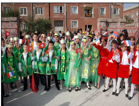
Children in Gyumri dressed in traditional Armenian clothes

Hope, as anticipation of good, is closely connected with confidence. As long as there is life, there is also hope. To hope means to have future. To hope means to be always in action, to strive for realization of one's dream, it means to have promise for life and salvation, i.e. to have a gift that will be good one in spite of the present ordeals."