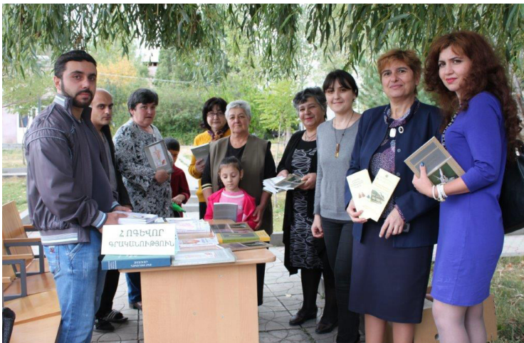
Book expo in the city of Gyumri featuring our publications.

Every town and village (regardless of topography), will be covered by the radio signal, a much better coverage than the national radio of Armenia. This is excellent and exciting news for the ministry of Christians for Armenia!